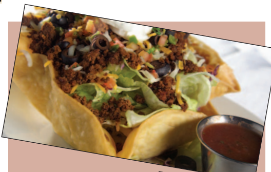
BEEF TACO SALAD

Lightly breaded and served with your choice of dipping sauce. 7.29