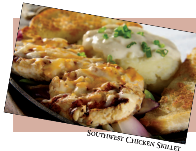
SOUTHWEST CHICKEN SKILLET

Chicken 10.99 Steak 11.49 Combo (Steak & Chicken) 13.49