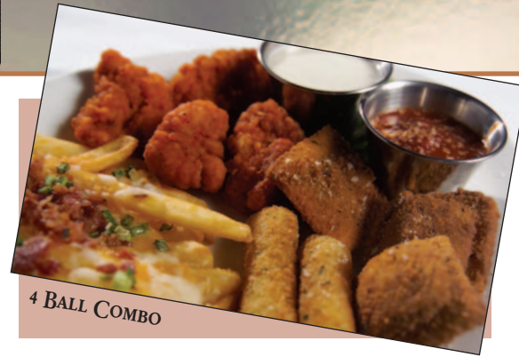
4 BALL COMBO

Substitute pulled pork or grilled chicken for $.99