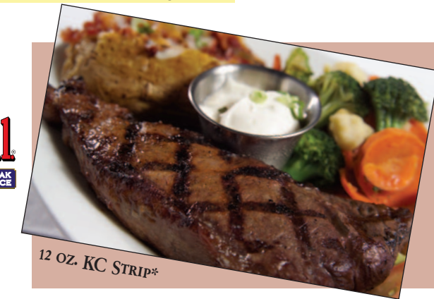
12 OZ. KC STRIP*

Grilled sirloin steak or grilled chicken breast smothered with cheddar and monterey jack cheeses, green and red peppers, and sautéed onions. Served with hearty homestyle mashed potatoes with savory gravy and garlic toast. 10.99